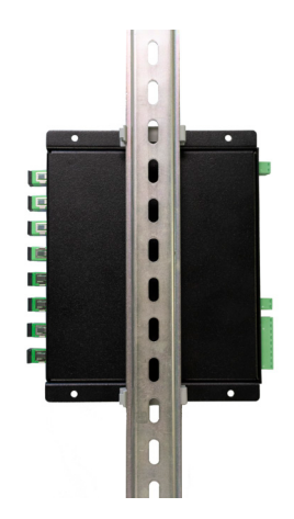
Example installation (bottom view)

See the FiberPatrol® FP400 Datasheet for a full system description.