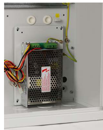
Enclosed PSU series: PS..., PSB...