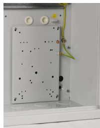
Empty mounting plate

Can be used for mounting transformers or power supply units: