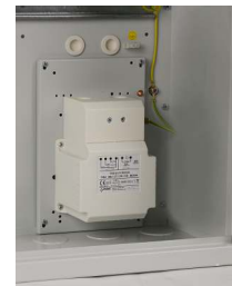
Transformers series: TRZ...