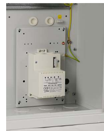
Transformers series: TRP...