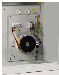
Transformers series: TOR...